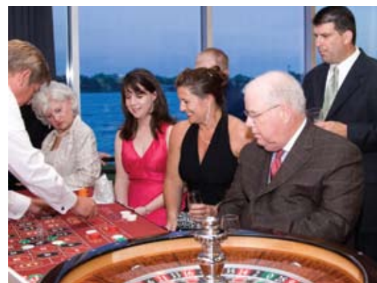
Guests enjoyed the many casino-style games at last year's Dossin Gala.

In addition, guests will experience the latest exhibitions on display at the region's premier maritime museum.