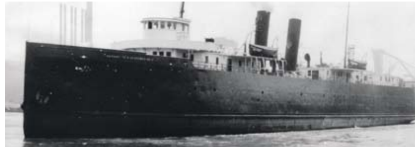
The Marquette & Bessemer No. 2 disappeared in Lake Erie on Dec. 8, 1909. The wreck was never found.