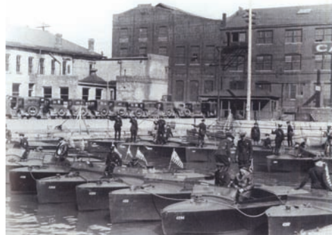
Law enforcement officials developed a fleet of patrol boats to combat bootlegging on the Detroit River.

Enterprising Detroiters made our city a hub of activity during the Prohibition years, and on Saturday, May 21, a unique tour will give you a chance to explore this chapter in our history first-hand by sailing past some of the bootleggers' favorite locations along the Detroit River!