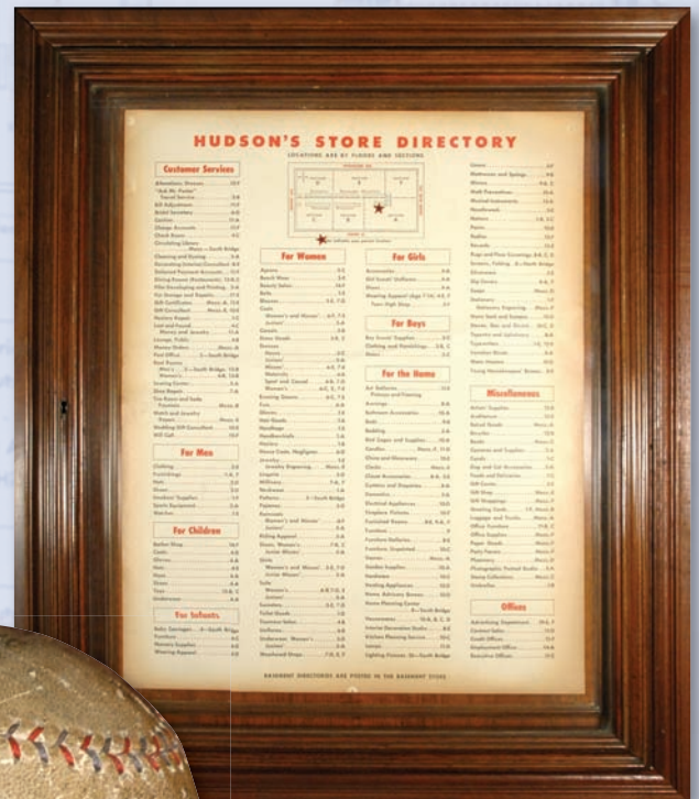
Hudson's store directory