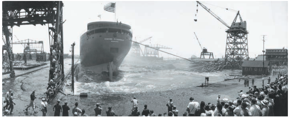
The S.S. Edmund Fitzgerald prior to its launch.