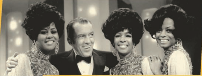
Detroit's Award Winners