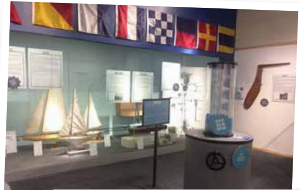
How Does That Work? opened over the summer at the Dossin, offering a hands-on, interactive look at the mechanics of boats and maritime tools like periscopes, rudders, lighthouse lenses, outboard motors, steam engines and flares.