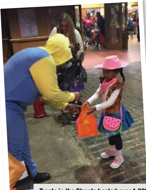
Treats in the Streets hosted over 1,300 children for an afternoon of trick or treating in The Streets of Old Detroit .