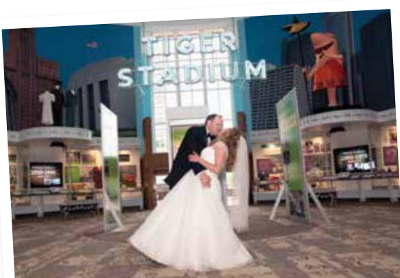
Our rental contract price increased 10% over the previous year as we continue to book more weddings and corporate events.