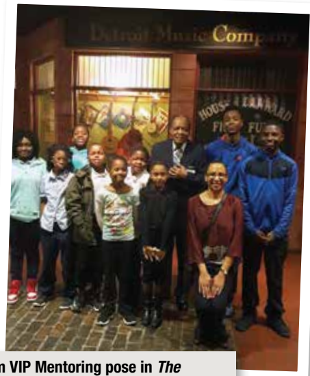
Students from VIP Mentoring pose in The Streets of Old Detroit during a visit to the Detroit Historical Museum.