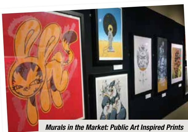
Murals in the Market: Public Art Inspired Prints showcased limited edition prints based on Murals in the Market projects that were created in Detroit's Eastern Market.