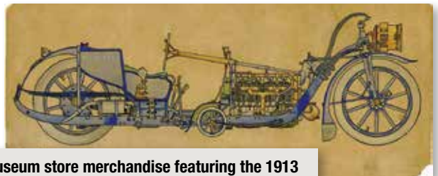
We created museum store merchandise featuring the 1913 Bi-Autogo, using drawings and photos from our collection.