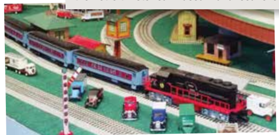
The Glancy Trains continue to delight visitors at the Detroit Historical Museum and local events.