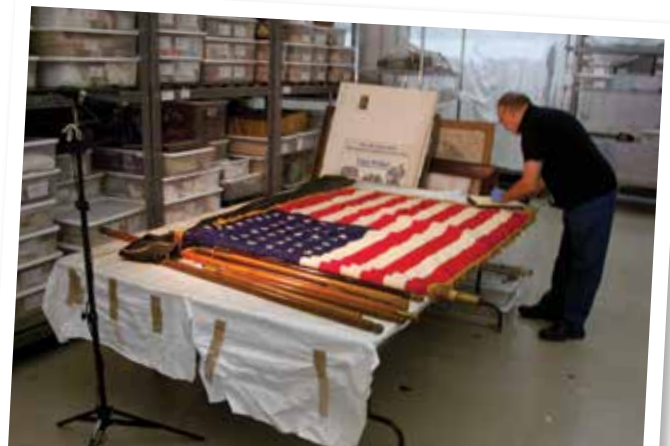
Society volunteers contributed 14,880 hours of work during FY17 at the Detroit Historical Museum, Dossin Great Lakes Museum and Collections Resource Center.