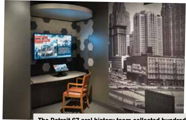
The Detroit 67 oral history team collected hundreds of firsthand recollections of 1967 that are housed in our online archive and accessible from a kiosk within the exhibition.