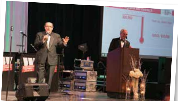
For the first time, guests at the 2016 Society Ball were able to submit auction bids and contributions from their phones using the BidPal platform.