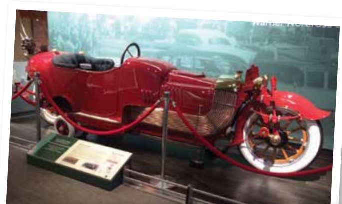
The Society's 1913 Bi-Autogo underwent a thorough cosmetic restoration from Detroit-based custom car company Mobsteel. It was featured in a February episode of the reality series Detroit Steel on the History Channel.