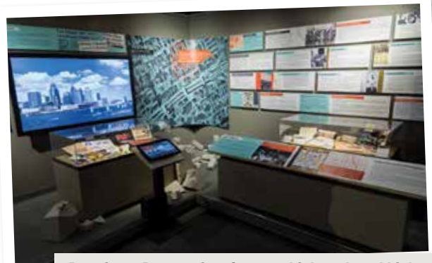
Detroit 67: Perspectives features high-tech and high-touch elements that visitors can use to dive deeper into the topics presented.